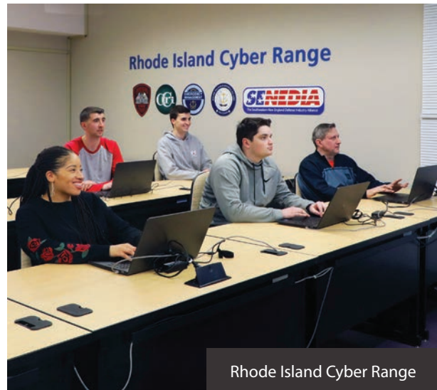
Rhode Island Cyber Range