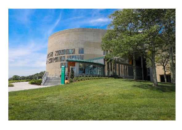
Knight Campus, 400 East Avenue, Warwick RI