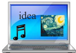
found on a website