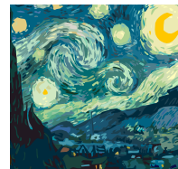
painted in a picture