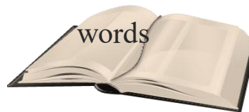
written in a book