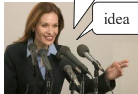
said in a speech