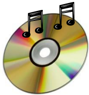
heard in a song

Documentation explains where borrowed words, statistics, ideas, pictures, charts, music, and other items came from.